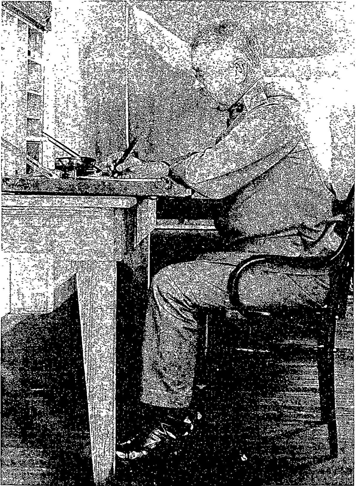
Brigadier General Joseph H. Pendleton at his desk in Santiago, D. R., late 1916.